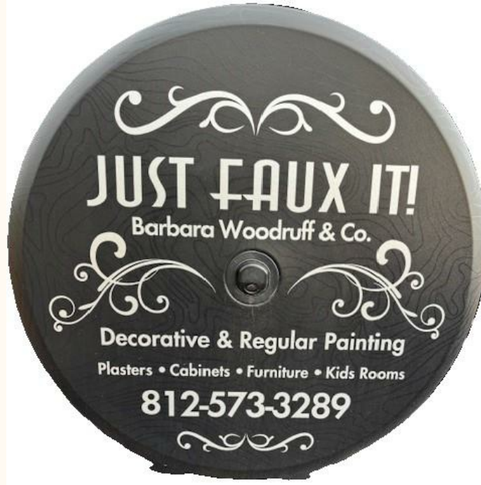
Just Faux It - Barb Woodruff