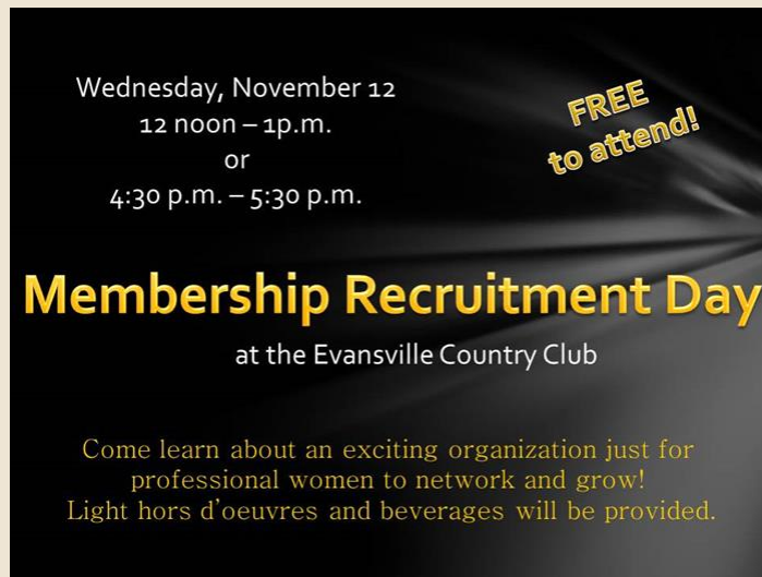
Table Space Available to Promote your Business